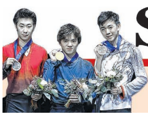
Gold medal winner Shoma Uno (C) of Japan, silver medal winner Jin Boyang (L) of China and bronze medal winner Vincent Zhou of the United States pose at the podium after the Men's Free Skating of the ISU Four Continents Figure Skating Championships in Anaheim, the United States, Feb. 9, 2019.